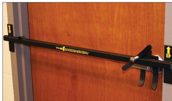
The Barracuda Intruder Defense System – Outward Swing Door Model

In 2016, The BILCO Company was sold by the Lyons family and is now a wholly owned subsidiary of AmesburyTruth in Minneapolis, Minnesota. AmesburyTruth is a division of Tyman PLC, a leading international supplier of engineered components for the door and window industry. Today, BILCO employs 50 local individuals at its manufacturing facility in Zanesville. The company is proud to support many local charitable organizations to help the needy and is committed to supporting education in the community as well.