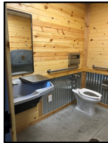
Restroom, completely finished, ADA compliant