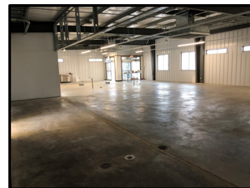
View of the interior, looking toward the front doors.

If you have questions or would like to schedule a viewing call or email: