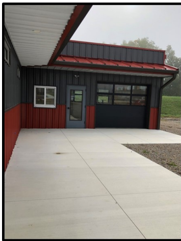
Walk-up window/dine-in area, with room for outside seating, located to the right of main entrance.