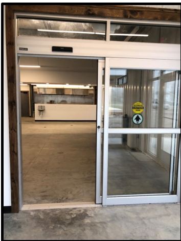
View from the main entrance, straight ahead is the commercial kitchen area.

To View More Details, Click HERE for a PDF Flyer and SCAN the QR CODE