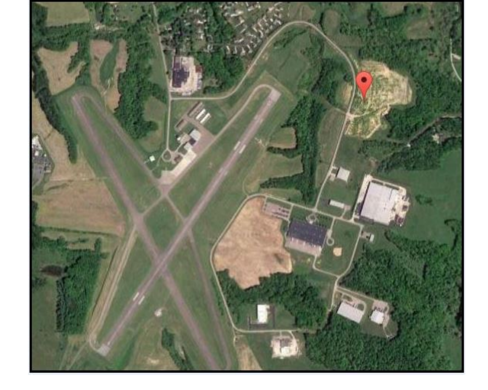
Click on the map for a printable PDF Fact Sheet about the Airport Business Park and surrounding area.