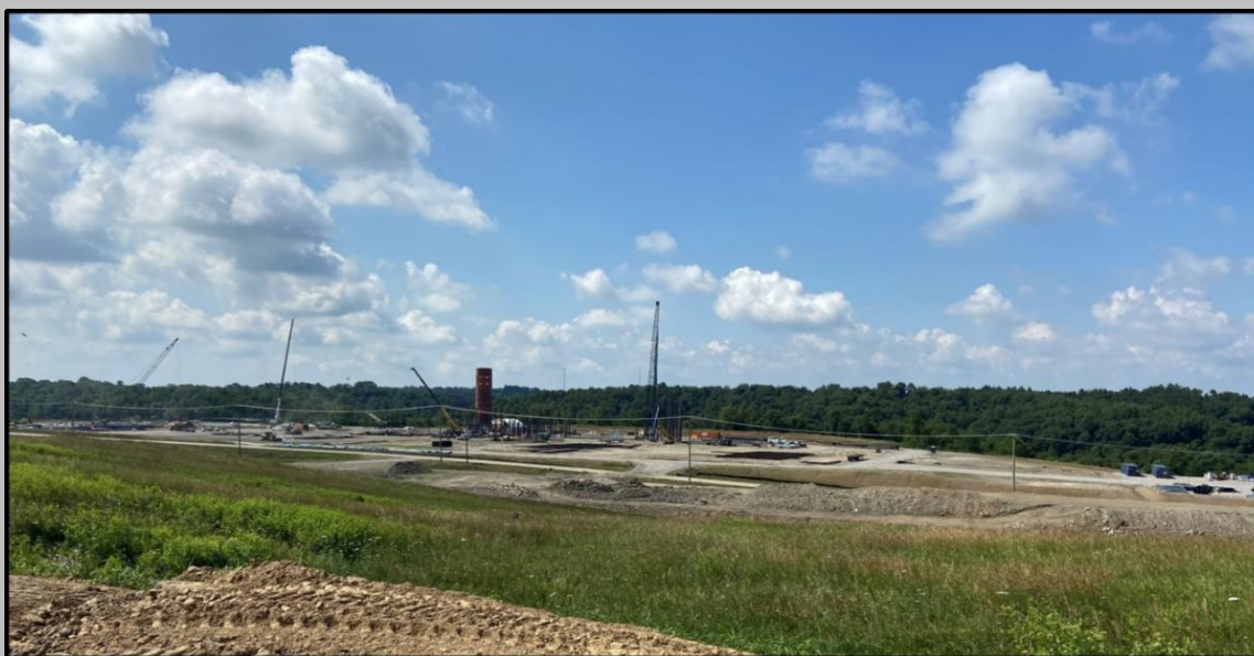
AMG Vanadium's $300 million project continues to take shape, beginning with the construction of the roaster (left).