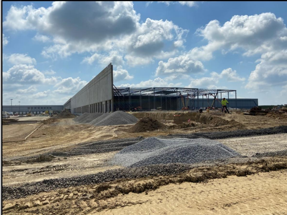
Construction continues on Dollar General's 130,000 square foot cold storage expansion project.