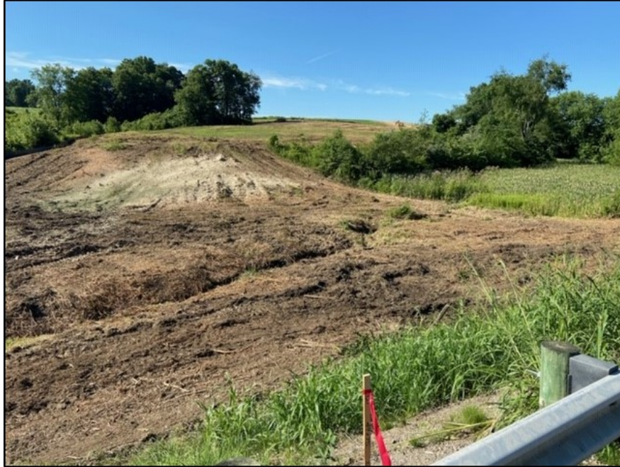
Construction view looking South from US 40 (East Pike). This will eventually become the entry to the National Road Business Park.