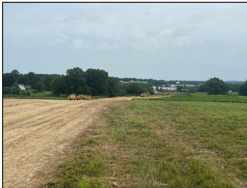
Construction view looking North, toward US 40 (East Pike).