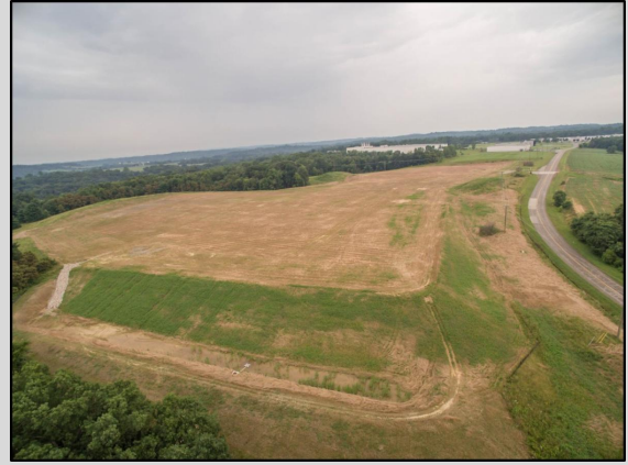
Click image to watch drone video of site

Zanesville Municipal Airport, which features two 5,000' runways and ILS. Click HERE for full site info, photos and drone video.