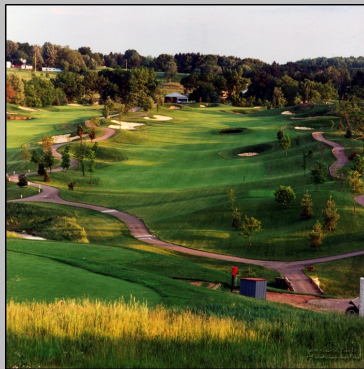
Eaglesticks Golf Course