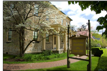
The Stone Academy