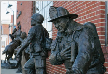
Sculptures line the sidewalk outside Alan Cottrill's Studio.

To obtain detailed information about advertising, brochure development, hospitality training, marketing strategies, motorcoach contacts, social media marketing or itinerary development click HERE .