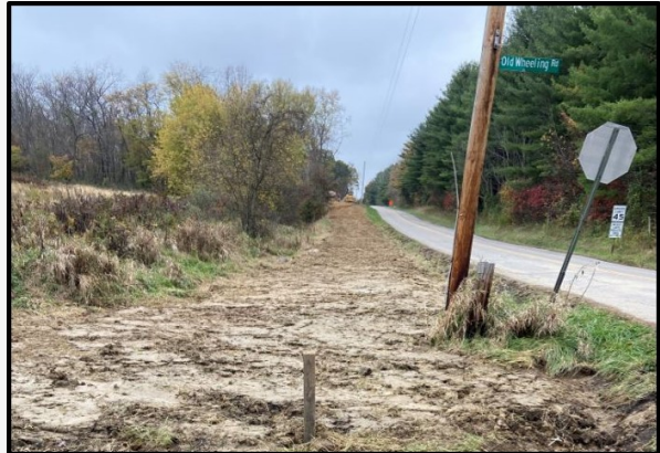
Below: You can see where the new sewer line has been installed.