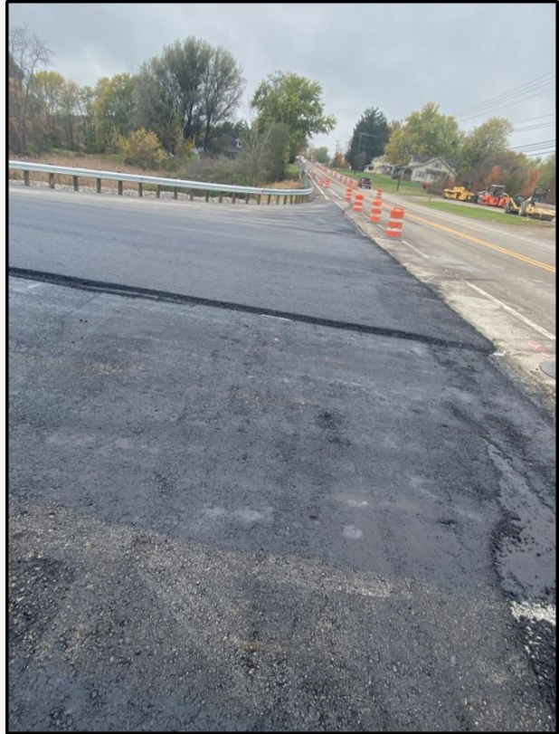
Above: The access road has officially connected with US 40.