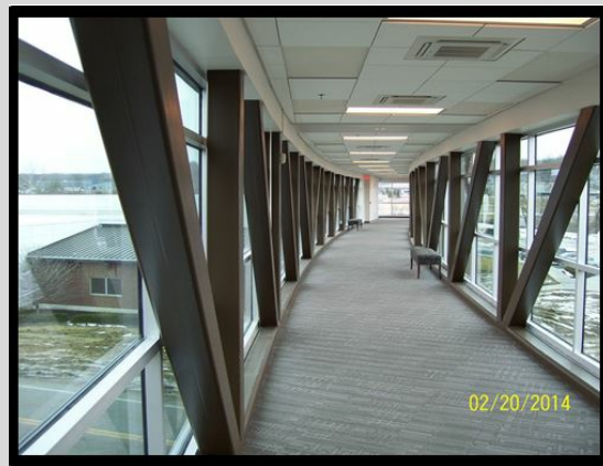
Zane State Cambridge Campus Pedestrian Bridge