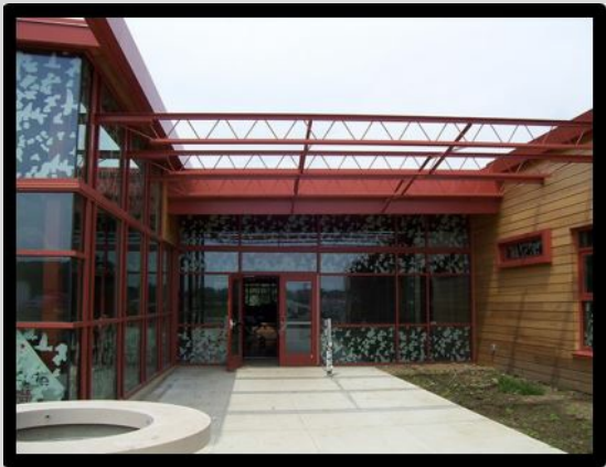
Grange Audubon Building