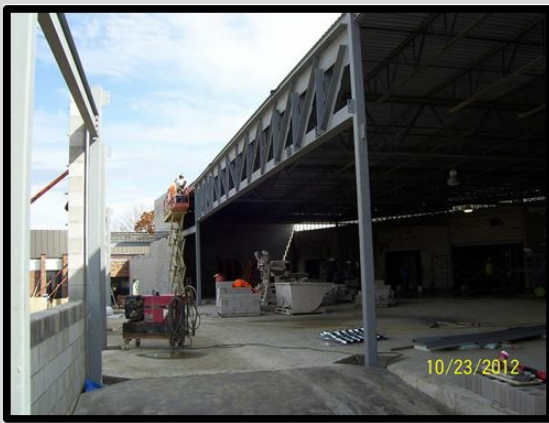
Mideast Career and Technology Center Steel Building