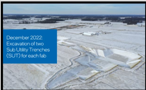
December 2022: Excavation of two Sub Utility Trenches (SUT) for each fab