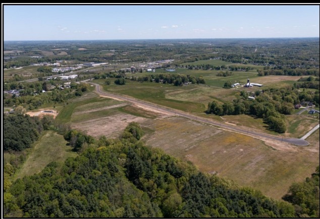
View facing west, 71.2-acre parcel in the foreground, access road to the right