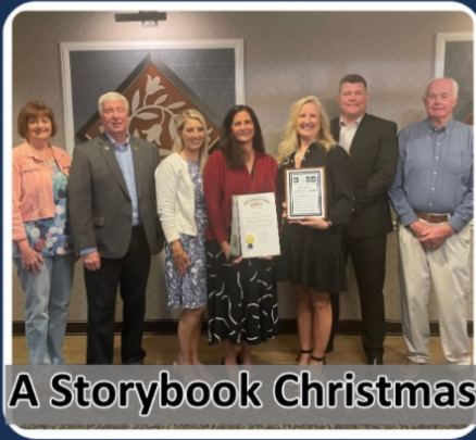
A Storybook Christmas