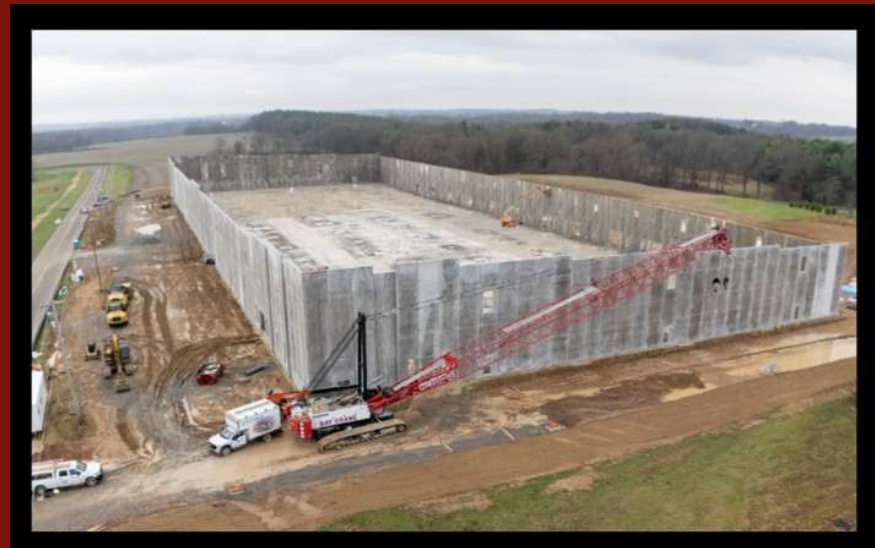
Marker Speculative Building

Expansion of existing Airport Business Park facility